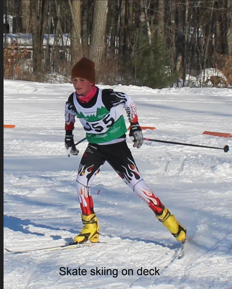
Skate skiing on deck

Have a ski shop or coach mark the kick pocket!