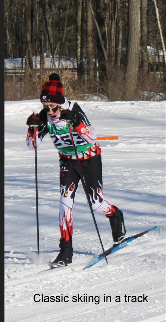
Classic skiing in a track

See a ski shop or coach for proper fitting!